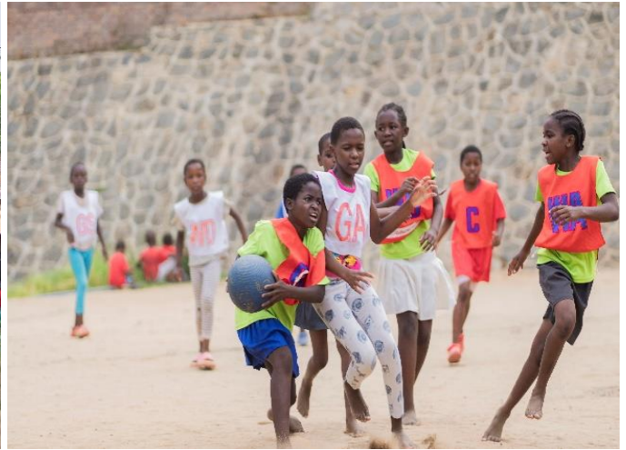
Figure 7: ESW VS CARLO ACUTIS