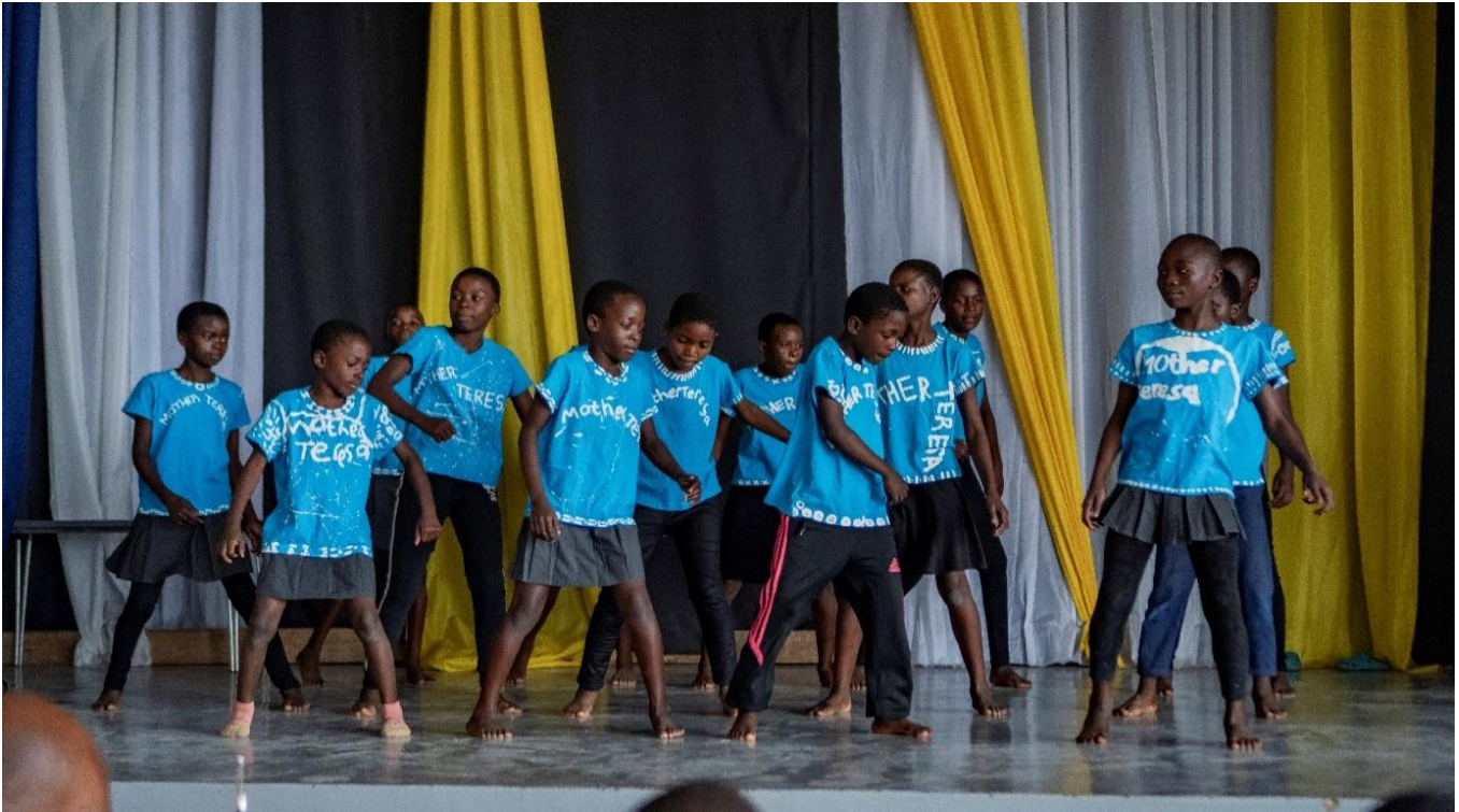
Figure 4: YOUNG CARES SHOWING CASING THEIR DANCING MOVES