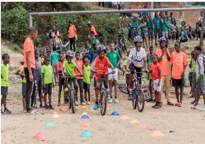
Figure 8: BIKE CLUB COMPETITION