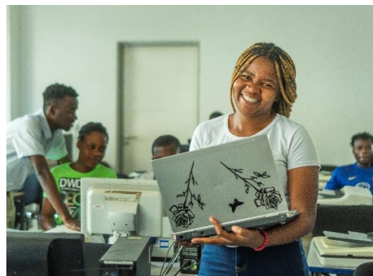
St John Paul II Catholic College 357 Female 200 Male

Mary Queen of Peace is fully sponsoring a total of 140 children across various educational institutions: 56 children at the Mother Teresa Catholic School (their nursery), 49 children at St. Kizito Catholic School, and 35 students at Carlo Acutis High School. These fully sponsored students receive brand new school uniforms, nutritious meals three times a day, and free transportation for those who live far from their schools. This comprehensive support ensures that the children have the necessary resources to thrive academically and maintain good health, while also alleviating the burden on families by covering transportation costs. This holistic approach underscores Mary Queen of Peace's commitment to providing a supportive and accessible learning environment for all its students.