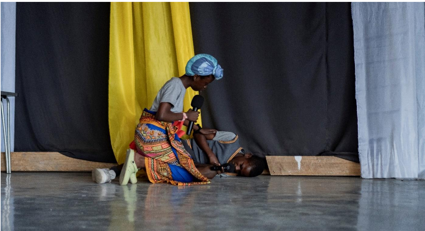
Figure 5 ST KIZITO PRIMARY PERFORMING THEIR DRAMA

The recent ACTS (Arts, Culture, and Talent Showcase) program organized by Mary Queen of Peace was a resounding success, uniting participants from various department at mother Teresa community to celebrate their unique talents. Highlights included Carlo Acutis High School winning the poem category with a moving recital, the Young Cares Group from Family Support clinching the top spot in the dancing category with an energetic performance, and ESW captivating the audience with a drama addressing social issues.