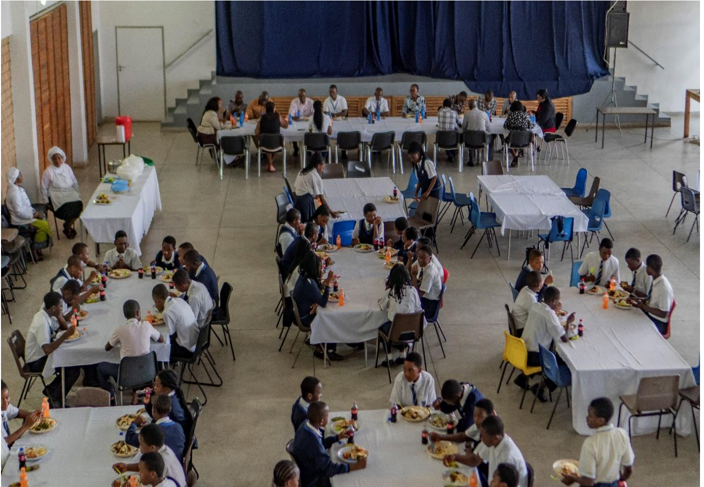
Figure 4: Carlo Acutis Students

On the 17th of May 2024, the Extended School Workers (ESW) program under Mary Queen of Peace organized a farewell party for 18 STD 8 learners as they prepared to sit for their Primary School Leaving Certificate of Education exams. The event was a celebratory send-off, acknowledging their hard work and dedication over the years. Each learner received a starter pack containing a pen, an instrument, and a pencil to assist them during exams. The event was further enriched by Mary Queen of Peace generously providing a delicious lunch, making the day even more memorable for the students. This initiative reflected the institution's commitment to supporting and recognizing the efforts of its students, aiming for positive outcomes in their examinations.