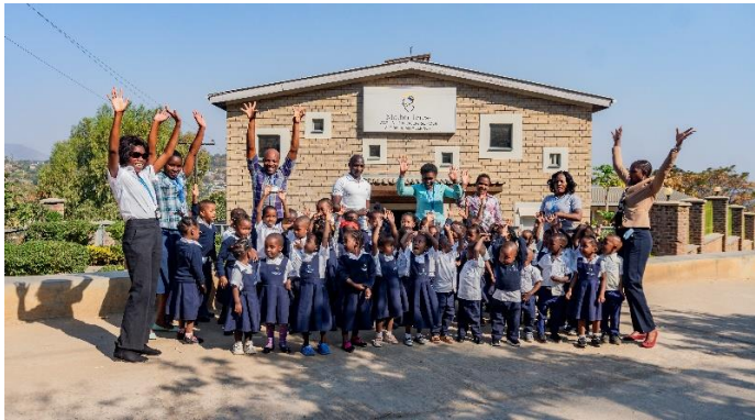
Mother Teresa Catholic Nursery School & Community Services 170 Children

Mary Queen of Peace currently enrolls a total of 1,183 students across its nursery, primary, high school, and college programs.