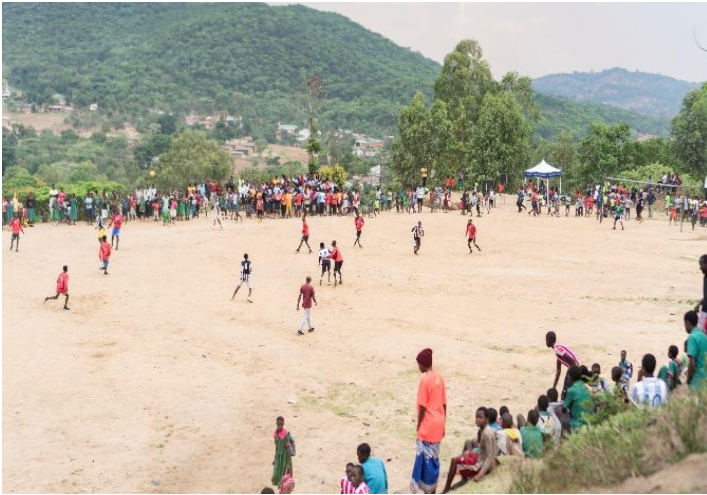
Figure 6: YOUNG CARES VS ST KIZITO PRIMARY