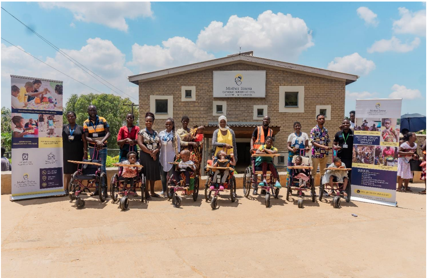
Figure 3: parents receiving their donation