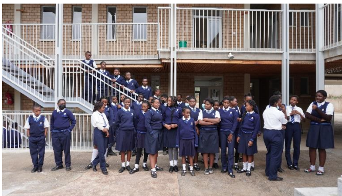
Carlo Acutis Catholic High School 71 Boys 74 Girls