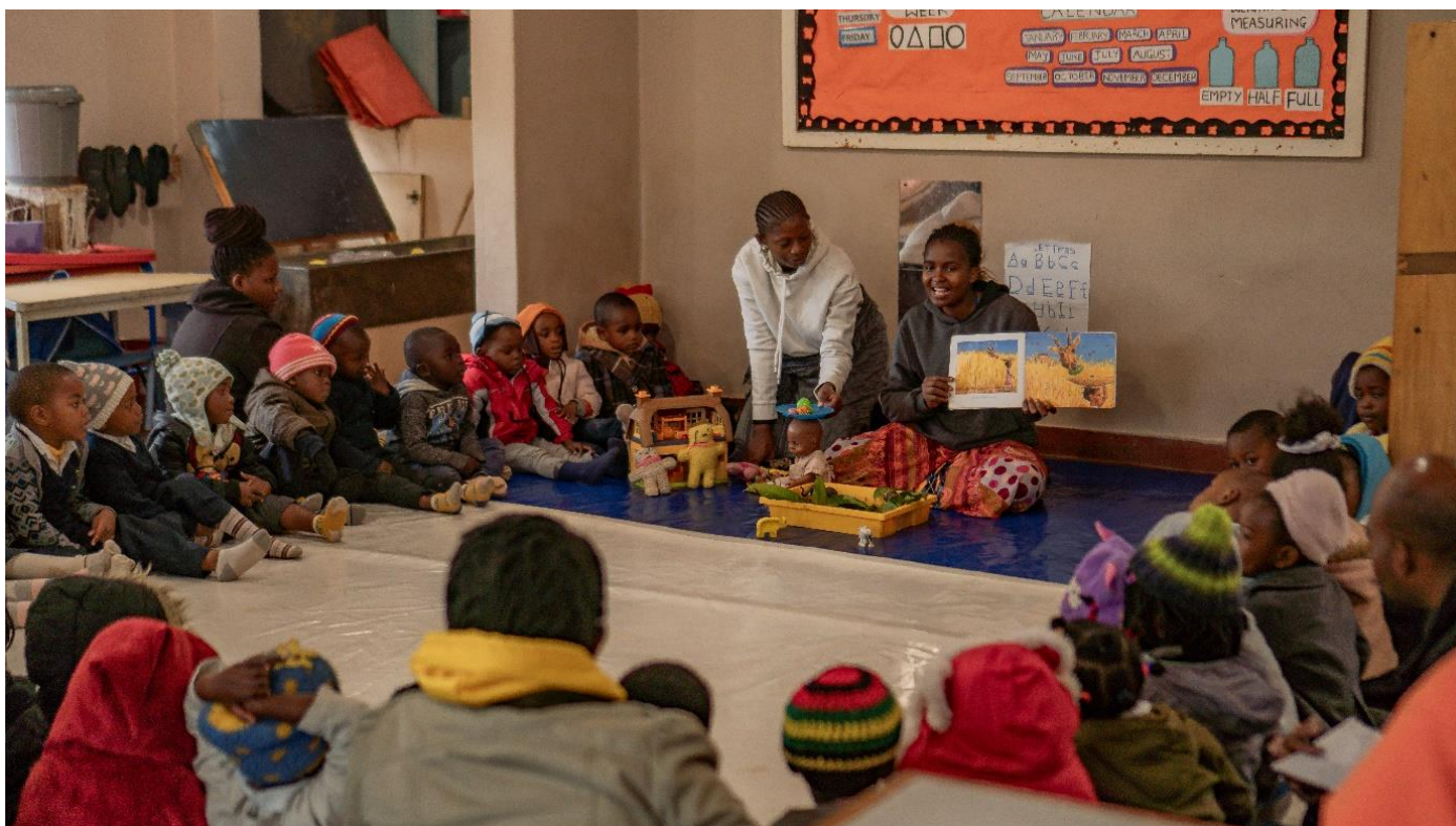
Figure 6: Story telling in guinea fowl class

At Mother Teresa Catholic Nursery School in Chilomoni, the power of stories is a cornerstone of the children's education. The children, full of excitement, gather on colorful mats, eagerly awaiting the start of story time with their beloved teachers. The teachers, with their warm smiles and gentle demeanours, hold large, vibrant books. The covers, adorned with enchanting illustrations, promise a journey into a world of wonder. As they begin to read, the room transforms into a magical place where anything is possible. The walls of the classroom are decorated with educational posters and the children's artwork, creating an environment that celebrates learning and creativity. These visual aids complement the stories, making the lessons more engaging and memorable.