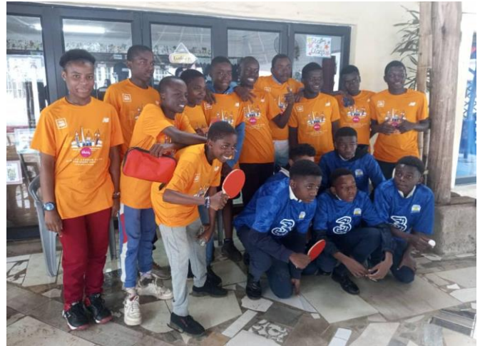
figure 9: ESW TABLE TENNIS VS NYASA ACADEMY

Mary Queen of Peace is passionately committed to fostering comprehensive student development through dynamic sports programs, boasting an impressive 95% participation rate even with constrained resources. Currently, the school offers netball, football, cricket, and table tennis, ensuring these activities are accessible to students from day-care to college age. This emphasis on sports cultivates physical fitness, teamwork, and discipline. Looking ahead, Mary Queen of Peace plans to expand its offerings to include badminton, hockey, basketball, and volleyball, further enhancing the range of opportunities for students to engage in physical activities and develop essential life skills.