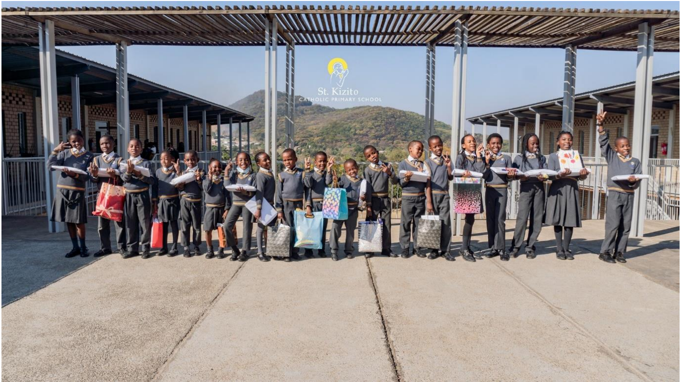
Figure 2 ;TOP achievers

St. Kizito has shown impressive academic performance, Achieving an overall pass rate of 85% in the recent academic period. Out of the total students, 267 passed their exams, with 147 boys and 120 girls meeting the required standards. This high pass rate highlights the effectiveness of the school's educational strategies and the supportive learning environment it provides to its students. The dedication of both the teachers and students has played a significant role in reaching this commendable outcome.