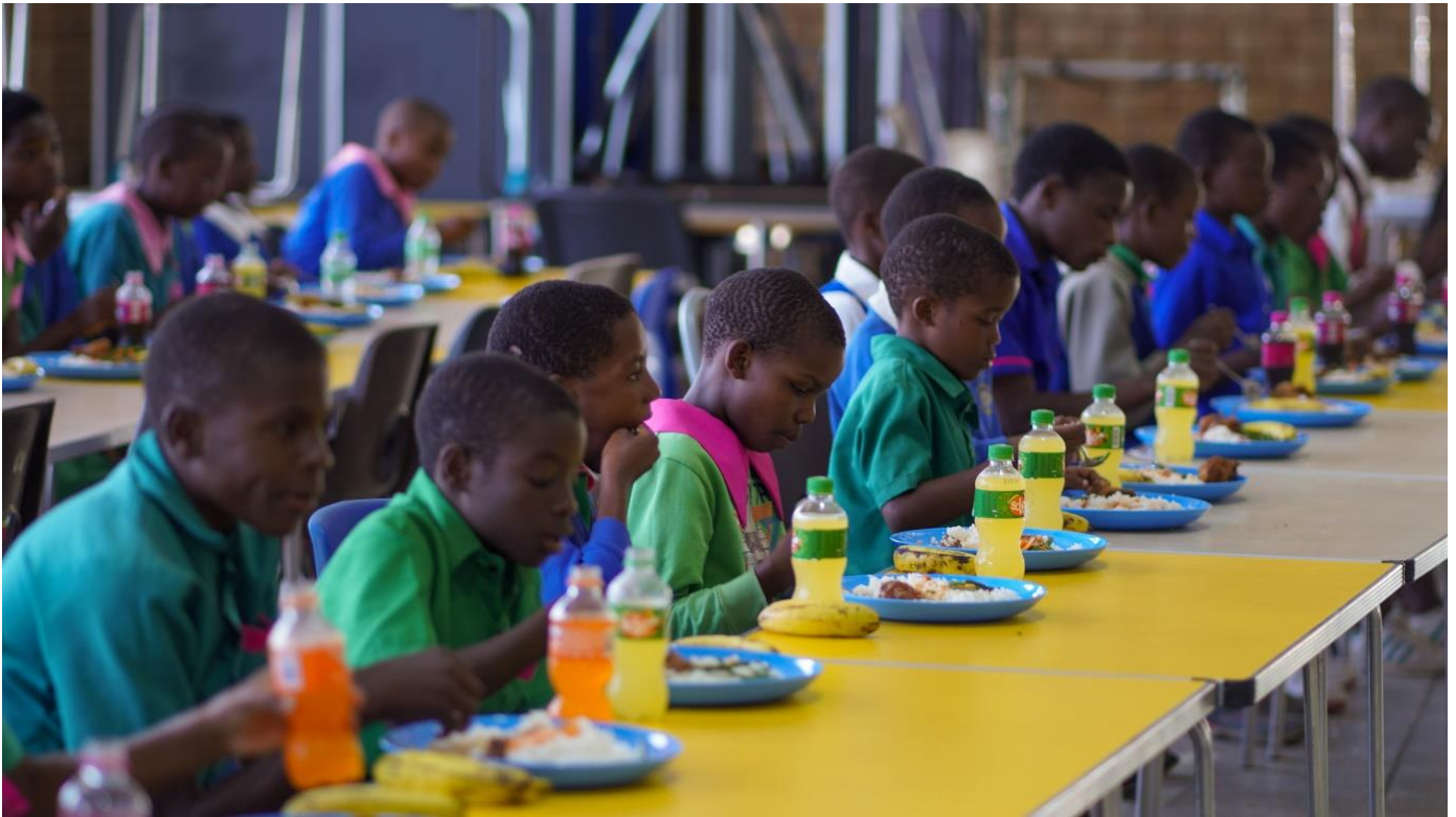
Figure 1: Students enjoy their meal during a year celebration